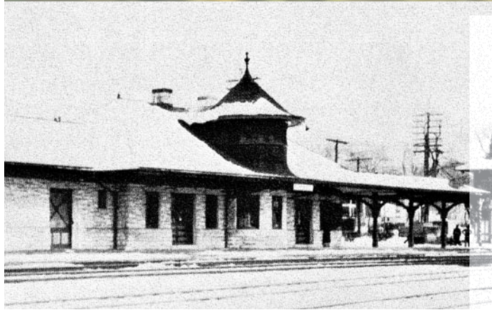
1913 - Little has changed on the original train station with the exceptions of the platform shelter and minor renovations.

At the center of the city and the hearts of most Kirkwood residents is the train station.