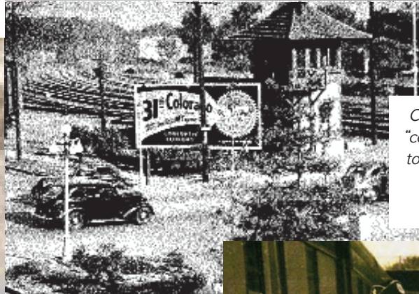
Circa 1938 - All aboard.. promising, "comfort and economy," you could travel to Colorado on the Missouri Pacific Lines for $31.65.