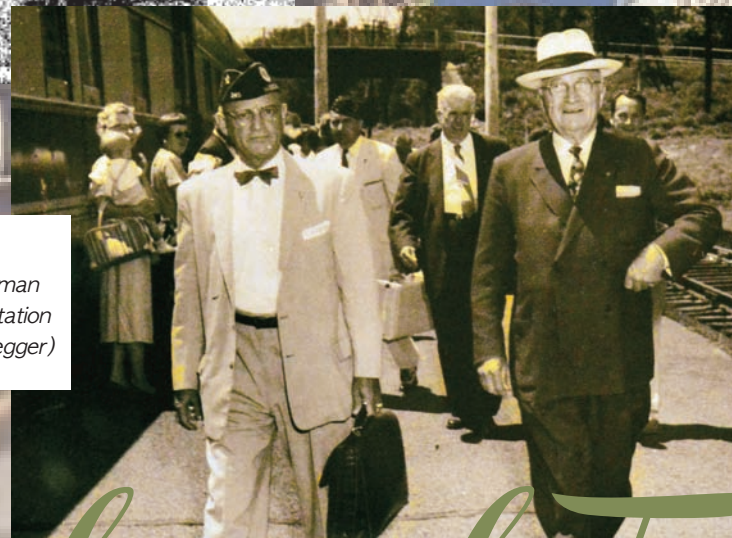
Circa 1948 President Harry S. Truman at the Kirkwood Train Station