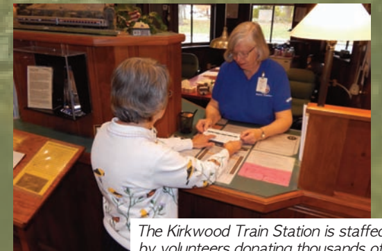
The Kirkwood Train Station is staffed by volunteers donating thousands of hours of time each year to promote and provide information to passengers and visitors about local sites, businesses and restaurants.

Donations to The Historic Kirkwood Train Station Foundation are tax deductible to the extent allowed by law. Sponsorship opportunities, for your consideration, are listed on the back.