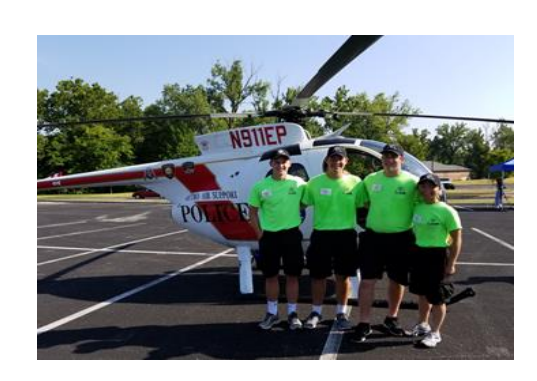
Greater St. Louis Area Law Enforcement Explorer Academy

This biennial event provides an opportunity for Law Enforcement Explorer posts to participate in a hands-on competition involving simulations, demonstrations by law enforcement agencies, national organizations, along with youth officer and adult training and recreational opportunities.