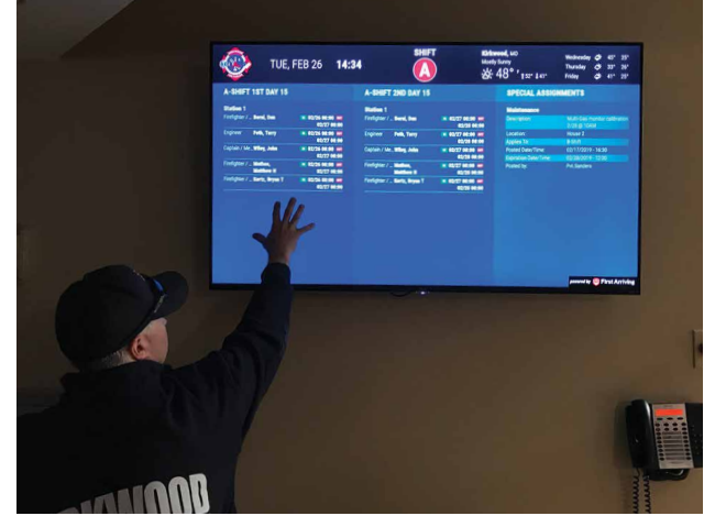
Fire Captain JT Wiley demonstrates the new PSIN system at Fire House 2 on Argonne Drive.

The new screens are not interactive but they can play training videos for staff. In all three Fire Houses, the screens are or will be installed in the kitchen, bay area, and bunk halls. Fire House 2 will have a 4th screen in the administration offices.