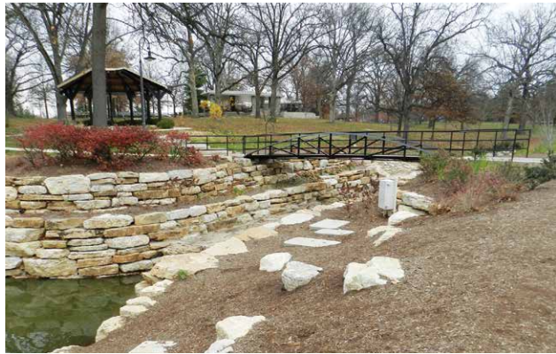
The foot bridge in Kirkwood Park that will be replaced.

A new footbridge to replace the one leading from the Community Center parking lot over the water and into the park was scheduled to arrive for installation on Wednesday, March 27 (after this newsletter has gone to press). This work involves freeing the old bridge from its mooring, raising it out, and setting it aside by crane. The new structure will then be craned in and set on the existing abutments. The old bridge was more than 30 years old. Photos of the new one will be posted on the City's website and on its Facebook page.