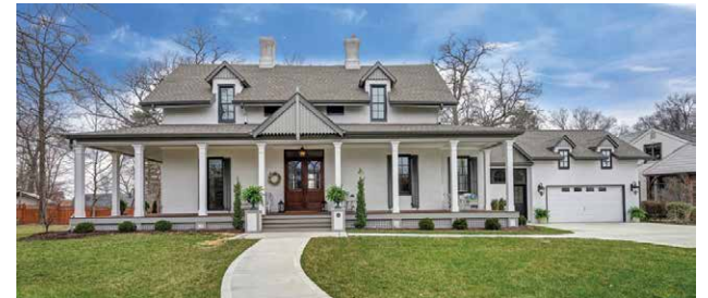
315 Altus Place, a Kirkwood Landmark that was awarded a Rehabilitation of Merit award in 2018.

May is National Preservation Month - the perfect time to show how Kirkwood's history honors the past and helps build the future. Nominations are currently being sought for "Favorite Buildings in Kirkwood." Buildings or places that are deserving of recognition contribute to the architectural character of Kirkwood. Nominees need not be a designated Kirkwood Landmark. Members of the Kirkwood Architectural Review Board and Landmarks Commission will review all nominations to select this year's recipients. The Favorite Building Awards will be presented on May 8, 2019, at 7:00 p.m. at City Hall.