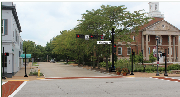
Rendering of proposed intersection changes, with new light poles and horizontal signals.

Safety improvements for pedestrians include ADA-compliant lighted intersections all along the route, with pedestrian push buttons and sidewalk connections across the BNSF railroad that will enhance accessibility. New ADA-compliant, wider sidewalks from Nipher Middle School south to Chester Avenue will improve student pedestrian safety as well.