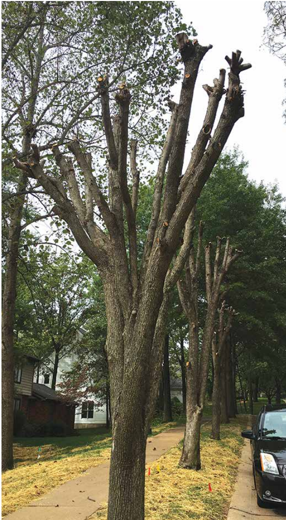
These trees in the right-of-way have been trimmed improperly. This is a heading cut or “topping” of trees, which is prohibited in the right-of-way.

Kirkwood City Council passed a new “Tree” ordinance in December 2018, a copy of which can be found on the City website on the Urban Forestry Commission page: kirkwoodmo.org/UrbanForestry . A new “Tree Manual” is also available to review on the same page of the website. Below are a few questions and answers about the new ordinance. The full set of FAQs will be mailed to residents with their February utility bills.