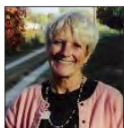
*Indicates trip led by professional guide Linda Koenig of Gateway Tours

Come join us on a guided tour of New Orleans and a visit to Mardi Gras World and discover all New Orleans has to offer. Learn about the history of Mardi Gras, watch artists at work and enjoy a slice of the famous King Cake! Visit the National WWII Museum, as well as go on a Riverboat Cruise on the Mississippi. Then we will journey beyond the city limits of New Orleans and discover the Destrehan Plantation, listed on the National Register of Historic Places. $75 Deposit due by 10/23. February 26th-March 2 (6 days, 5 nights) Res & NR $799