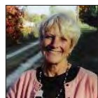
*indicates trip led by professional guide Linda Koenig of Gateway Tours

Thursday, Oct 20 9:00 am-4:30 pm Reg. Deadline: 10/6 Res $90 NR $95