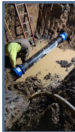
Essex 10" Cutout

The Geyer Road water main replacement project starting at Nirk and ending at Adams is just now getting underway. This will last approximately 180 days and requires daily lane closures at times. Please be patient and careful if travelling through this area.