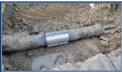
Couch @ Rose Hill – 16" Main Repairs

Did you know that one of our methods for water main break repairs is the use of a full circle clamp (see picture titled "16 inch repair @ Couch and Rosehill")? This 1, 2 or sometimes 3 piece clamp, which is made of stainless steel to last for years to come, is a permanent repair and makes for a quicker repair time than cutting in a new section of pipe. We are able to use this repair method as long as the failure is not over 26 inches.